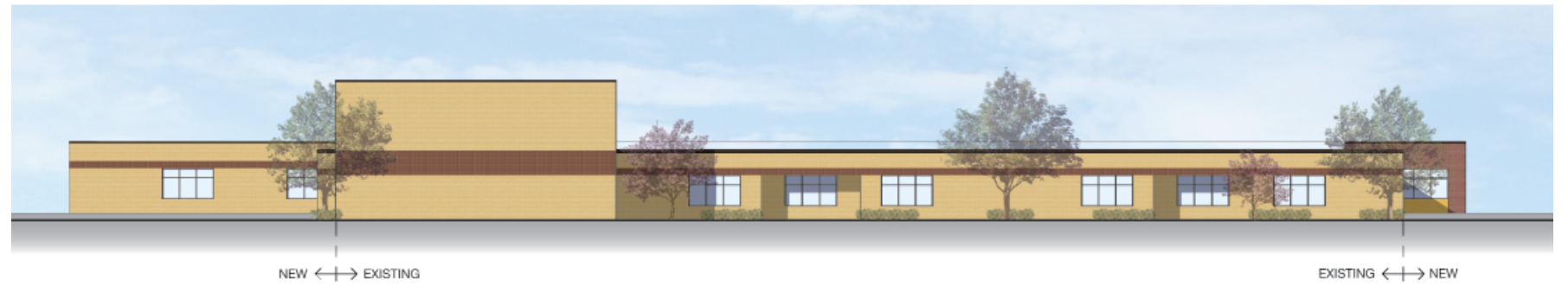
② SOUTH ELEVATION