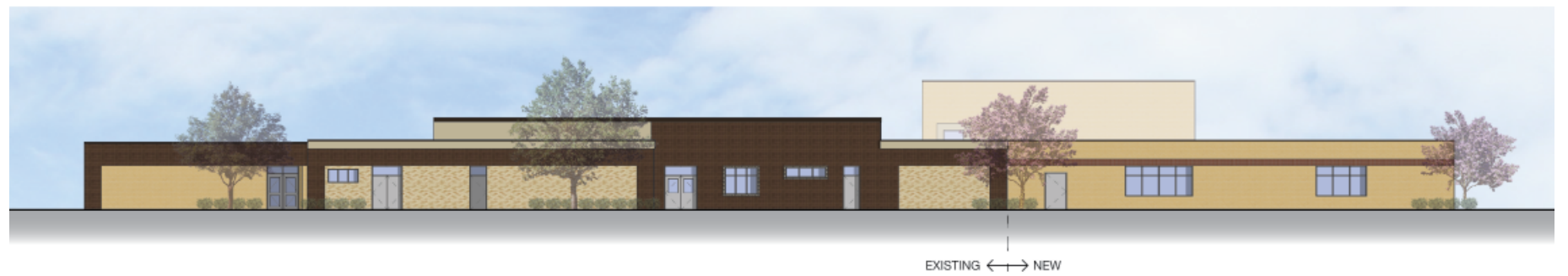
④ NORTH ELEVATION