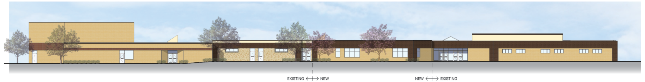
① EAST ELEVATION